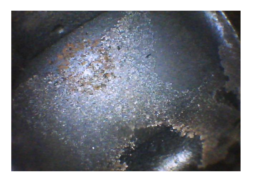
Before Cylinder 3