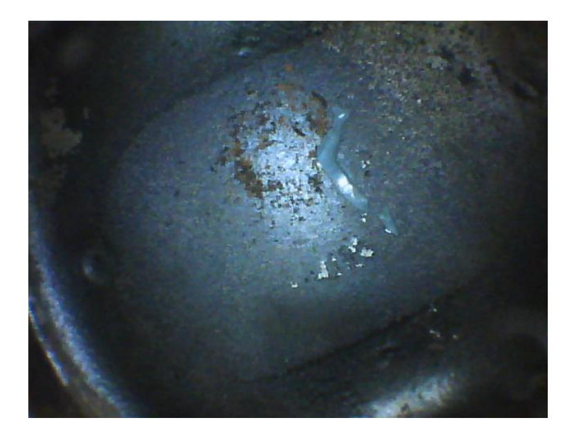
Before Cylinder 2