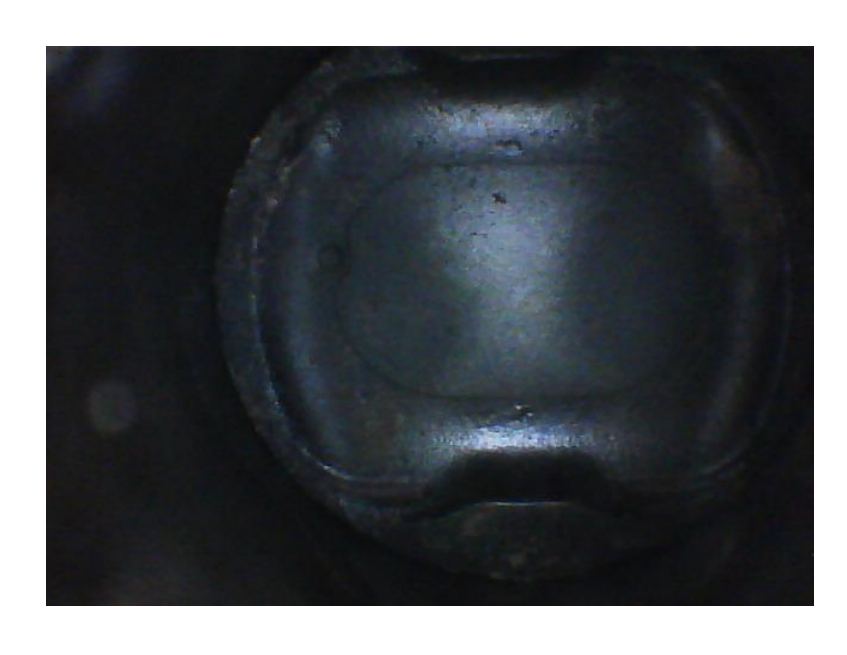
After Cylinder 4