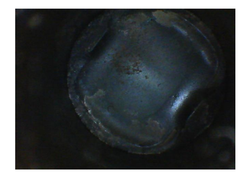
Before Cylinder 4