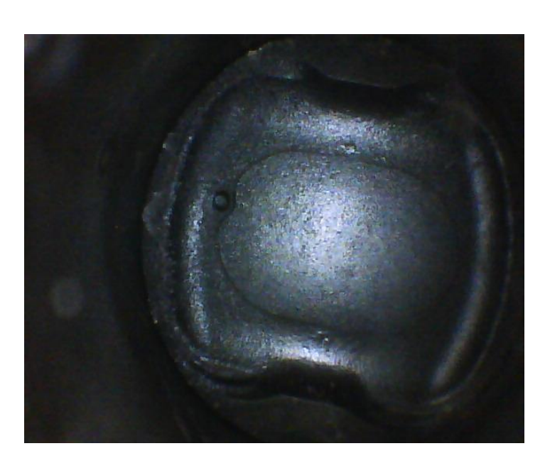
After Cylinder 1