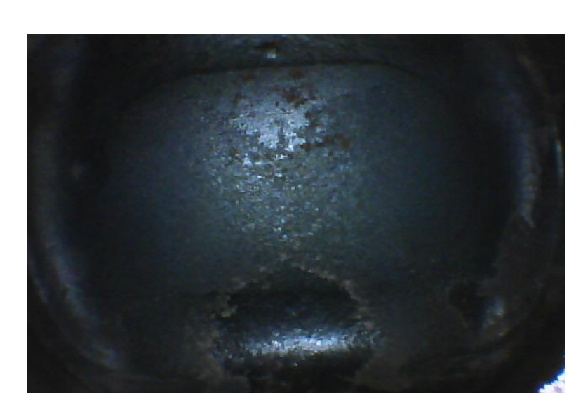
After Cylinder 3