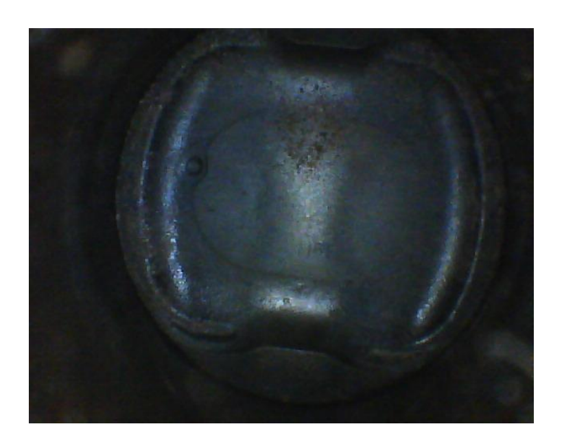
Before Cylinder 1